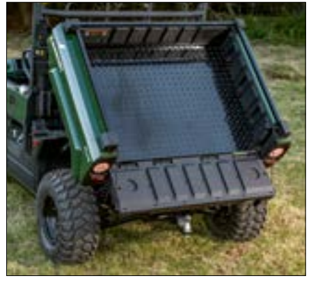
CARGO BED AND TOWING CAPACITY The PRO-MX offers a 317 kg (700 lbs) cargo bed capacity, and a 680 kg (1,500 lbs) towing capacity