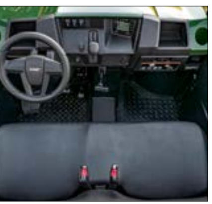
ROOMY SEATING FOR TWO Complementing ample shoulder, knee and legroom for two adults, the bench seat features contoured seating for both driver and passenger.