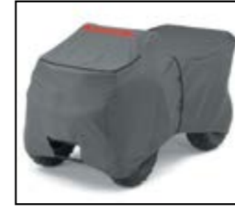
ATV COVER Protect your ATV with this water and mildew-resistant cover featuring dual security straps and zippered fuel tank access, plus front and rear openings for tie-downs.