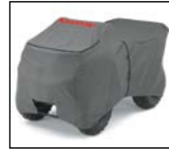
ATV COVER Protect your ATV with this water and mildew-resistant cover featuring dual security straps and zippered fuel tank access, plus front and rear openings for tie-downs.