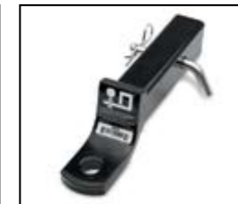
TOWBALL BRACKET For all your towing needs: this bracket facilitates attachment of most towball hitches.