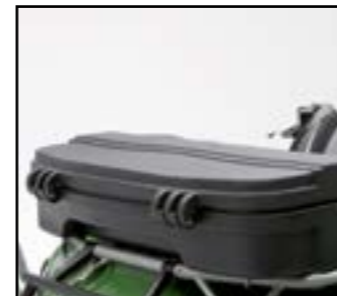
CARGO BOX Lockable high-strength polyethylene box. Rubber-sealed lid to keep out dust and water. Bolts solidly in place. Size: L 860cm x W 460cm x H 180cm. Black.