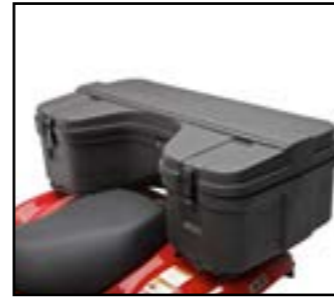
REAR CARGO BOX With a rubber-sealed lid to keep out dust and water plus two lockable latches. This sturdy polyethylene bodied box bolts firmly to the rack (L 101 x W 48 x H 30 cm).