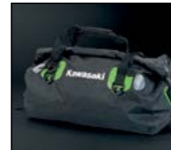
LUGGAGE ROLL 35 LITRE WATERPROOF Strong waterproof and UV-resistant Kawasaki luggage roll with shoulder strap, safety retro-reflective details and four attachment points. Size: 35 l (Ø30 cm, length 55cm).