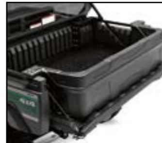
BED EXTENDER Maximise the usage of the load bed on your MULE by using the bed extender, the clamps allow you to adjust the length to your cargo.