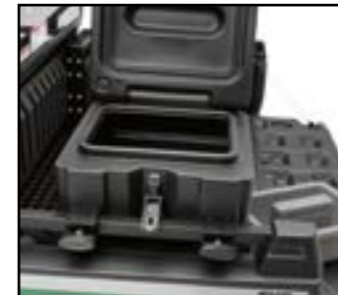
CARGO BOX Secure small items on your excursions with this versatile storage case. Features an insert for additional organisation. Can be locked for extra security.