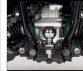
TOWBALL A towball is an essential accessory to many, and this one is E-approved for use in Europe. Ball = 5,0 cm diameter. Shaft = 2,4 cm, thread 2,0 cm diameter.