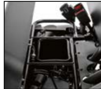
STORAGE BIN Make good use of the space under the passenger seat to fit this useful 13.6-litre storage bin. Seat bottom acts as a lid for the contents.