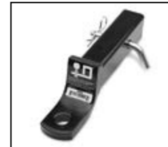
TOWBALL BRACKET For all your towing needs: this bracket facilitates attachment of most towball hitches.