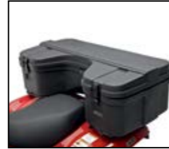
REAR CARGO BOX With a rubber-sealed lid to keep out dust and water plus two lockable latches. This sturdy polyethylene bodied box bolts firmly to the rack (L 101 x W 48 x H 30 cm).