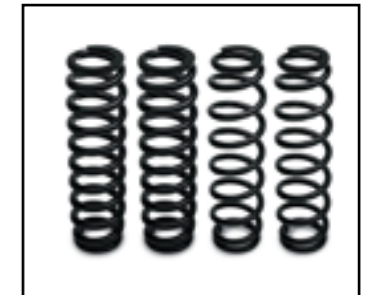
HEAVY DUTY SPRINGS For sustained transportation of heavy loads over challenging terrain, these heavy duty springs allow the MULE to operate at full capacity all the time.