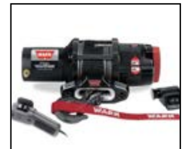
WARN® ProVantage™ winches A powerful permanent magnet motor, a smooth efficient three-stage planetary gear train, metal gear housing, an easy-to-use clutch control dial, fully sealed to keep the elements out, a patented roller disc brake for excellent control while winching, and a corrosion-resistant black powder-coated finish with a unique black hook and tie rods.