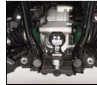
TOWBALL A towball is an essential accessory to many, and this one is E-approved for use in Europe.