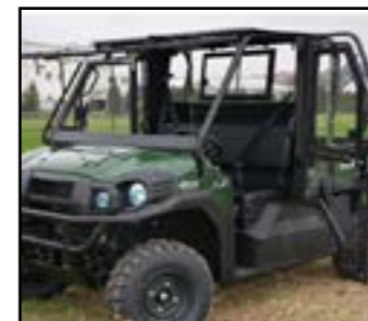
HARD CABIN FOR DX Structure made of high grade steel with quality black finish. Flip-up tinted single layer safety glass windscreen with rubber seals and locks. The doors are equipped with hydraulic stoppers, automotive style locks and sliding safety glass side windows.