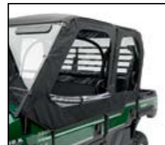
SOFT CABIN SYSTEM Modular system to protect the user from the elements. Consists of: top, doors, and polycarbonate windshield; all sold separately.