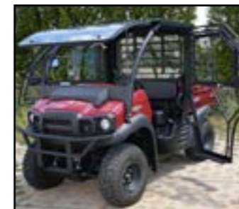
HARD CABIN FOR SX Structure made of high grade steel with quality black finish. Flip-up tinted single layer safety glass windscreen with rubber seals and locks. The doors are equipped with hydraulic stoppers, automotive style locks and sliding safety glass side windows. Available in packages and as modular parts.