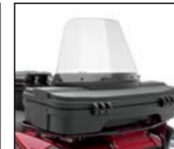
ATV WINDSHIELD Mounts to front cargo box. Durable 6mm hard-coated polycarbonate. Size: H 35cm, W 56cm. Windshield top 61 cm above rack surface. Cargo box (ATV900001) required - not included.