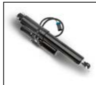
BED LIFT KIT Self-contained hydraulic system to effortlessly raise the full-rated load of the MULE load bed. Easy to install and operate.