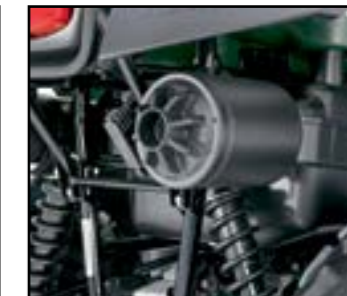
STORAGE CASE (CANISTER) Storage canister with screw-on lid that attaches to right rear of ATV.