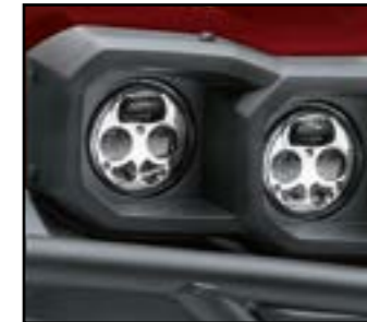
LED LAMPS Replace or supplement standard halogen lights with LED headlamps. These use less power to deliver a 50% brighter output with longer life.