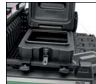
CARGO BOX Secure small items on your excursions with this versatile storage case. Features an insert for additional organisation. Can be locked for extra security.