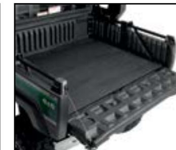
BED LINER Protect your loading bed from wear and damage with this durable bed liner.