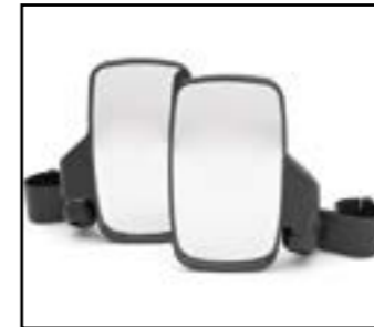
SIDE MIRRORS Fit these adjustable side mirrors for increased safety in the work zone and easier vision for manoeuvrability on site.