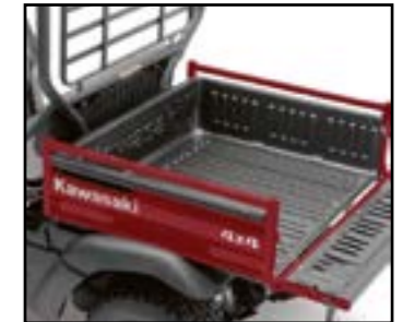
BED MAT Thick, tough rubber mat protects the load bed, reduces load slip and cuts down on noise. MULE logo imprinted on centre of bed mat.